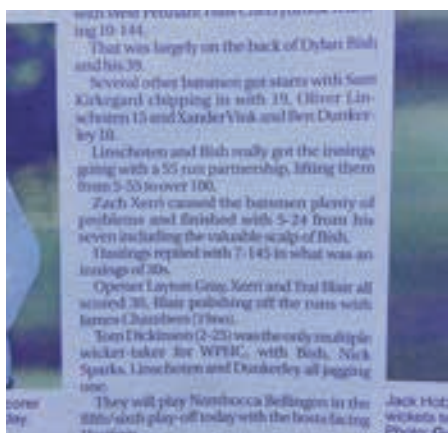
Newspaper coverage of our U14 Tamworth team vs Hastings