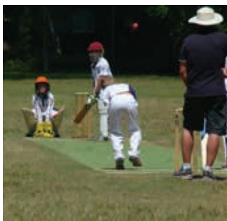
U11 Green Vs Berowra @ the Old Dairy - 20 February 2016