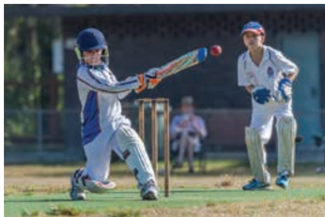
U10 Red team Vs Kissing Point at Mimosa Oval 12 March 2016