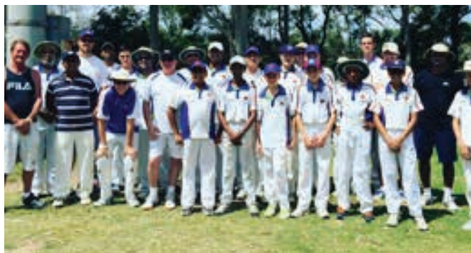
Our D2 Senior Team had a forfeit so a Senior/Junior game was quickly organised at Holland Reserve