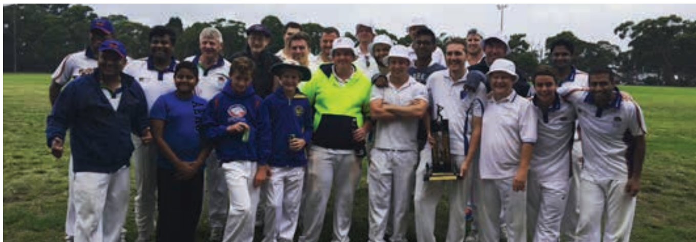
D2 Grand Final WPHCCC vs. Saint Ives