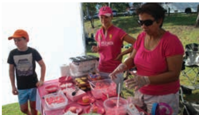
Pink Stumps day 12 March 2016 (Edward Bennett Oval) – our dedicated volunteers from the U9s.