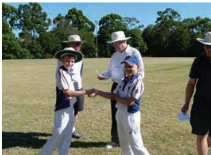
U11 Grand Final, Green and Blue Captains