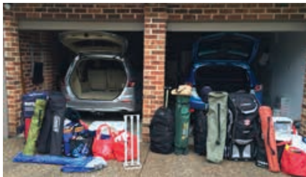
Photo – Julian Bish's garage (3 January 2016) all packed and ready to go to Tamworth and Taree - 3 January 2016.