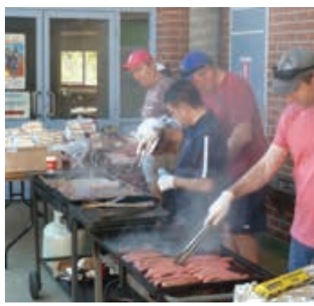
U8 parents hard at work at Junior Presentations