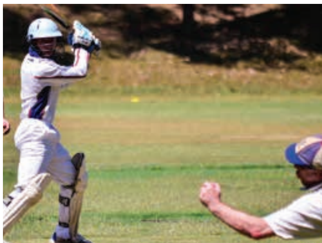
B1 Semi Final Turning Point