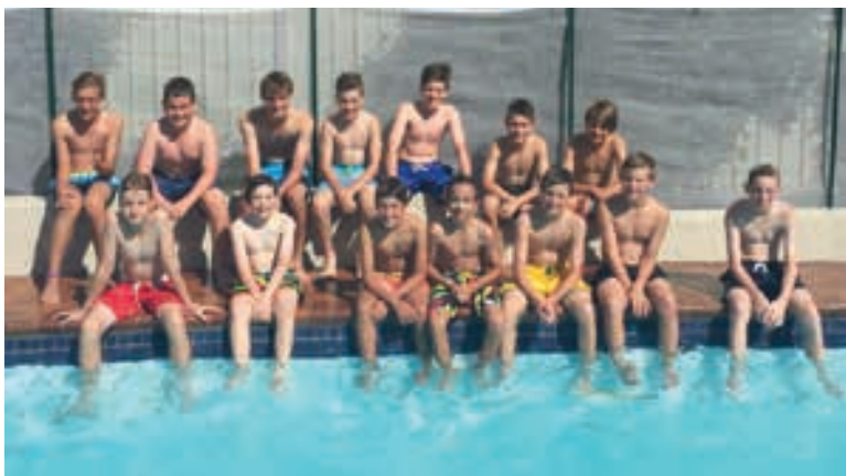
Back at the Hotel Pool