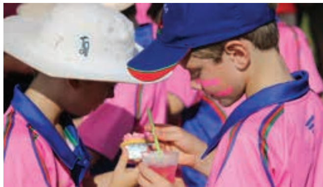
12 March 2016 (Edward Bennett Oval) – enjoying the flavours!