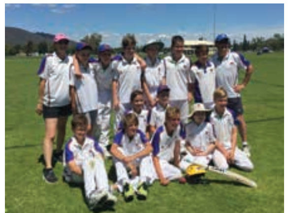
U14 Tamworth Team after our final day win