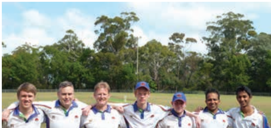
B2 team - Fathers and sons