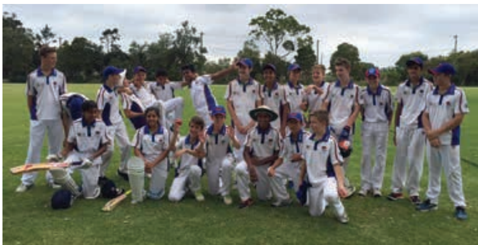
Gold vs Blue Final Round at Northolm

The final round game had us matched up against the Blue team. A win from either team would book themselves a top 4 spot and a finals berth. The Gold team was to prevail in a great spirited contest.