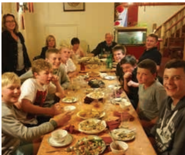
Top Left: Our Armidale Team watches on Bottom Left: Team photo ready for action Above: Annual Chilli Eating Contest