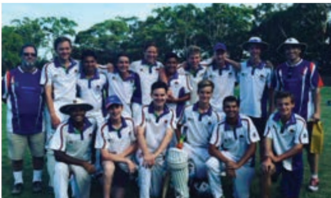
U16 Gold at their Grand Final