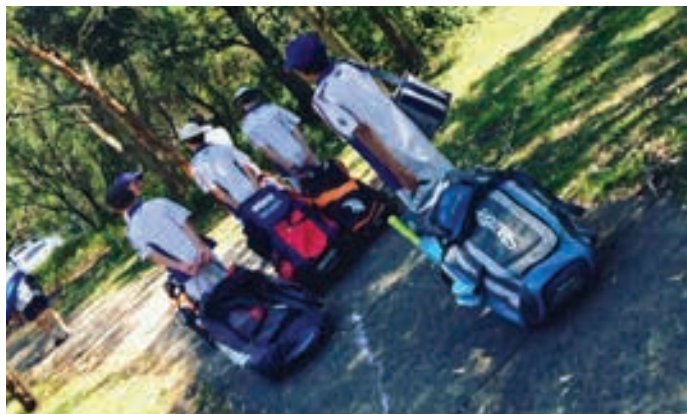
The team gear bag a thing of the past