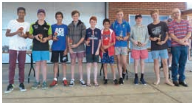
Our Century-Scorers, 5-FORS and hat-trick trophy winners