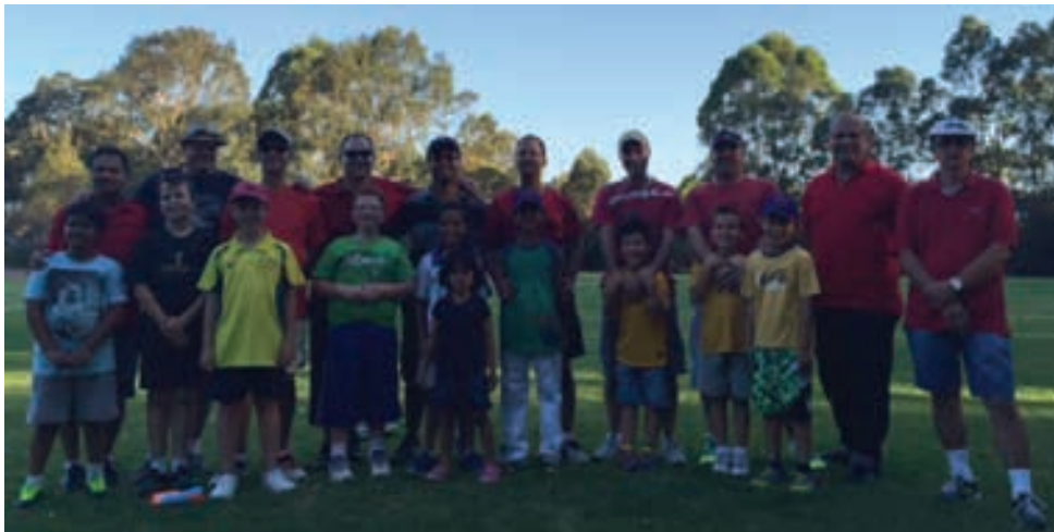
U10 Blue team – after Father son game and BBQ