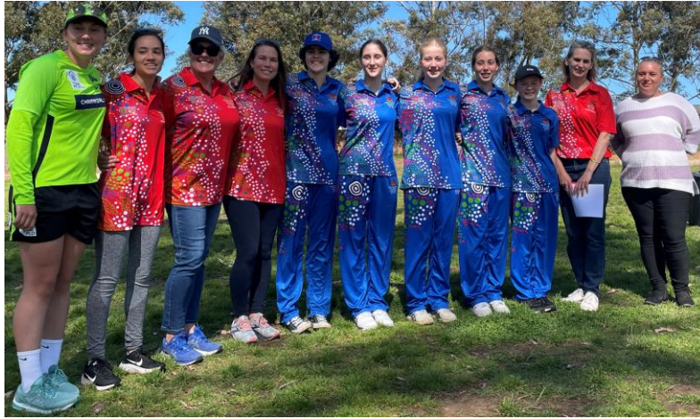
Launch of the Girls Players (Blue) and Volunreers (Red) outfits – WPH Public School 18 September 2022

On Wednesday 25 May 2022 our Club Executive Committee approved a radical design change in the playing uniform exclusively for our Women (Volunteers) & Girls (Players).