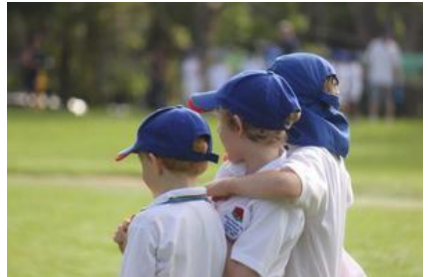
Photo – Kanga 2012/13 at Edward Bennett Oval.