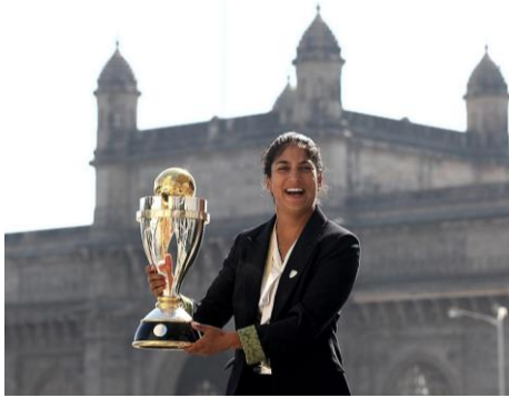
Photo: Lisa Sthalekar with the World Cup trophy, Australia v West Indies, Final, Women's World Cup 2013, Mumbai, February 18, 2013

If, after this filter, more than one player remains in contention then performances for Representative Teams (Grade and Brewer Shield) are taken into account.