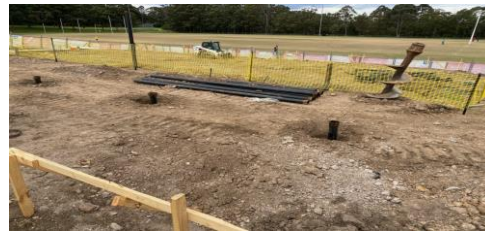
Construction starts – 13 September 2020