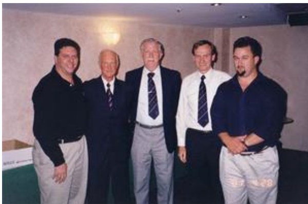
Photo – Life Members at the Seniors Presentation Night, Hornsby RSL 1998.