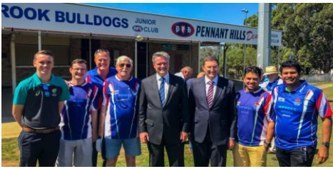
With Mathias Cormann 15 March 2018