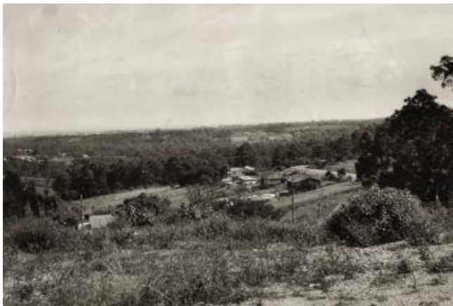
Photo: Oratava Avenue and the West Pennant Hills Valley from Pennant Hills Rd, 1962.

Note the cost of $4,500 for ¼ acre blocks with $20 for a full deposit!