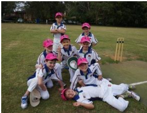
Photo – our U9 Blue's ready to do "battle" with our U9 Orange at Cherrybrook Public School – McGrath Pink Stumps Day 22nd February 2014.

The following link has been used by the McGrath Foundation in its National promotion of Pink Stumps Day – http://pinkstumpsday2016.gofundraise.com.au/cms/videos