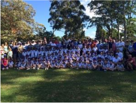
Kangas spending a moment in memory – 29 th November 2014 at Edward Bennett Oval.

The 27 November 2014 saw the loss of Phillip Hughes through a tragic accident at the SCG. Across Australia recognition was given to Phillip through many gestures. The following photos capture the moment in our Club.