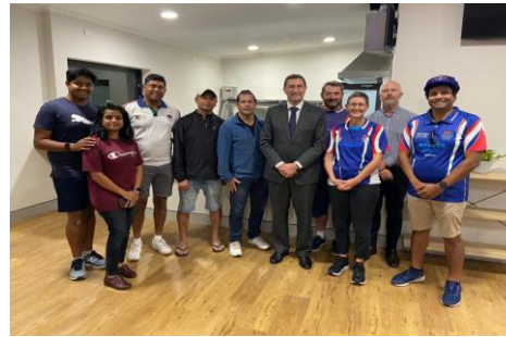
Official Opening 30 March 2021