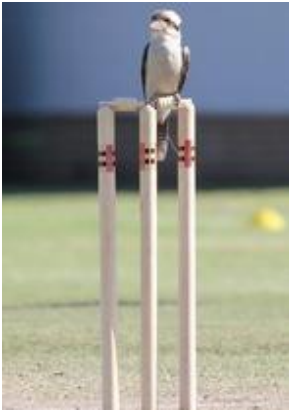
Photo : a Kookaburra enjoying the game at Asquith Oval – March 2011.