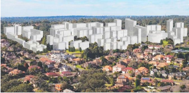
Photo – proposed development around Highs Road and Coonara Avenue.

The game changer in our future is the Sydney Norwest Metro project and the development of rapid transit rail links from Chatswood through Castle Hill to Rouse Hill. This will change the face of the Cherrybrook / Castle Hill area around the rail stations.