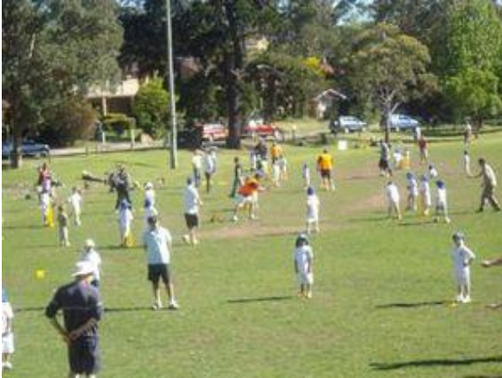
Photo – Kanga kick-off – Saturday 17th October 2009 at Edward Bennett Oval. 120 Kanga's plus dads, mums and grandparents.