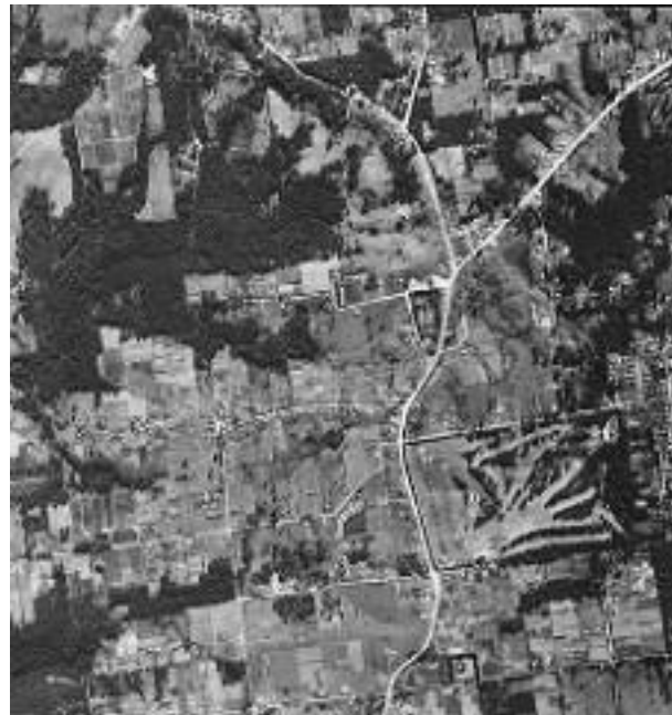
Photo: Aerial photo of West Pennant Hills in 1951. Pennant Hills Golf Course is shown on the bottom right. The fork in the road is Thomson's Corner. At the top of the photo, the orchards along New Line Road can be seen.