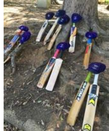
A1 bat display at The Glade Oval – 29 th November 2014.