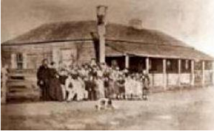
Photo: Pennant Hills West Public School circa 1870.