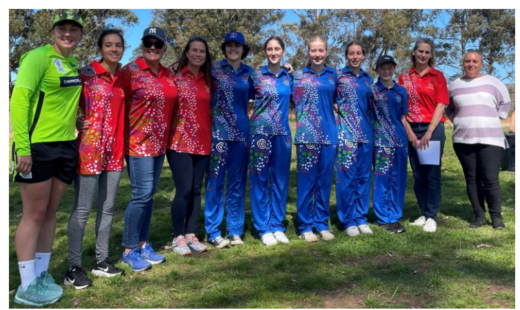
Launch of the Girls Players (Blue) and Volunreers (Red) outfits - WPH Public School 18 September 2022

On Wednesday 25 May 2022 our Club Executive Committee approved a radical design change in the playing uniform exclusively for our Women (Volunteers) & Girls (Players).