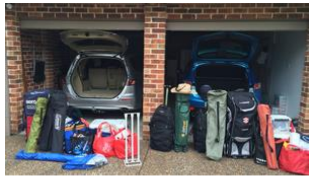
<u>Photo</u> – it must be the first week of January. Here the Bish family are ready to pack the car before heading off to Taree and Armidale – 3 January 2016.

One of the privileges of playing for West Penno is the chance to play in the Country Carnivals over the New Year. Traditionally this opportunity is reserved for Representative Teams but we are privileged to be invited due to our Club size – the only Club side in NSW to have this opportunity.