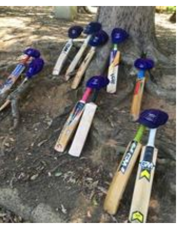
A1 bat display at The Glade Oval – 29<sup>th</sup> November 2014.