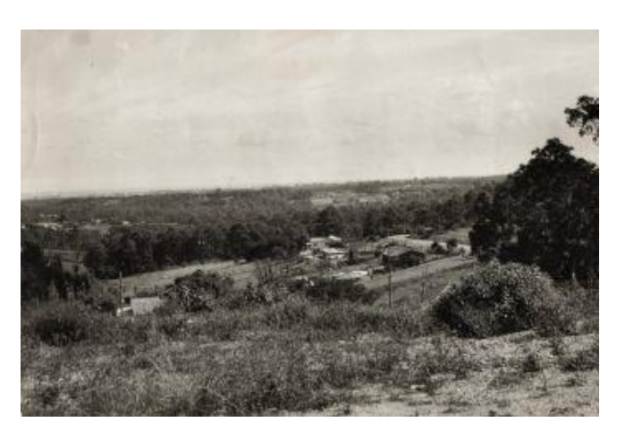
<u>Photo</u>: Oratava Avenue and the West Pennant Hills Valley from Pennant Hills Rd, 1962.

Note the cost of $4,500 for \(^1\)4 acre blocks with $20 for a full deposit!