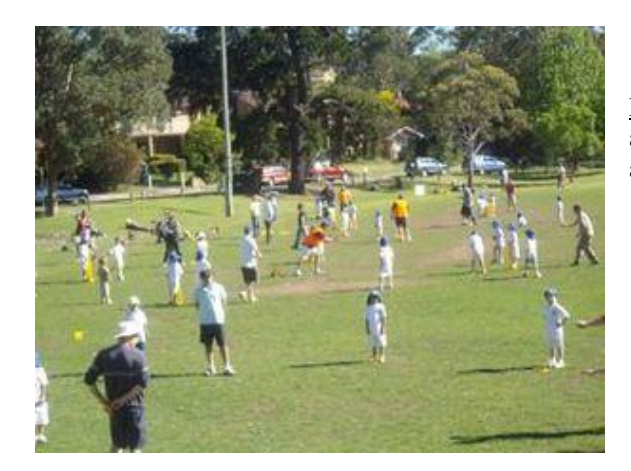
<u>Photo</u> – Kanga kick-off – Saturday 17th October 2009 at Edward Bennett Oval. 120 Kanga's plus dads, mums and grandparents.

Photo - Kanga 2012/13 at Edward Bennett Oval.