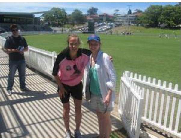
<u>Photo</u> –Edwina Chappell with Elyse Perry @ Drummoyne Oval Ladies Day, 21st November 2010.