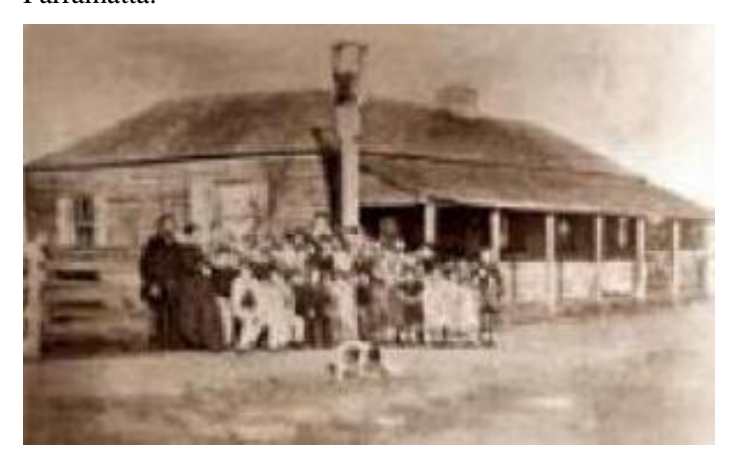
<u>Photo</u>: Pennant Hills West Public School circa 1870.