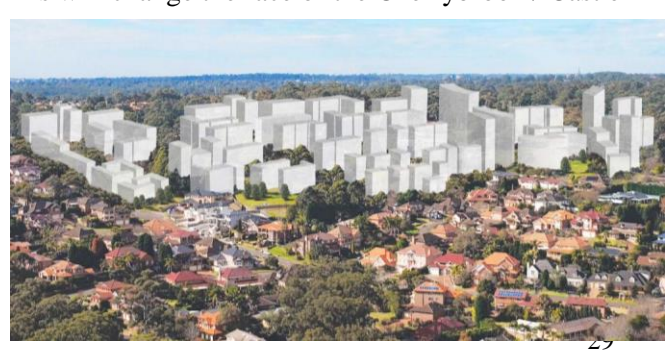
<u>Photo</u> – proposed development around Highs Road and Coonara Avenue.

This will change the face of the Cherrybrook / Castle Hill area around the rail stations.