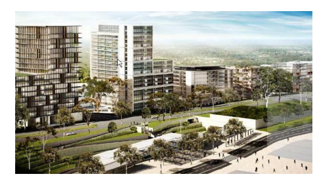
<u>Photo</u> – proposed Cherrybrook Station opposite the new train station