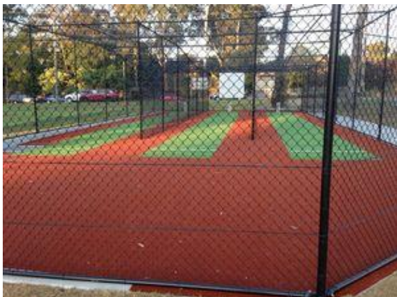
Photo – the WPH Sports Club nets - just after completion on 4 th September 2013

The replacement nets were first used for Club training on Saturday 7 th September 2013.