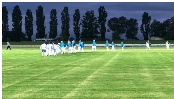
Photo: at the end of the game – Regional Bank Australia Sportsground, Armidale

On Wednesday 3 rd 2018 our U15 boys became the first Team in our History to play a Day / Night game under lights. They played Ballina District Junior Cricket Association at Regional Bank Australia Sportsground in the Walter Taylor Shield game. We lost the game but the boys had a once in a lifetime opportunity to play under lights with a white ball.