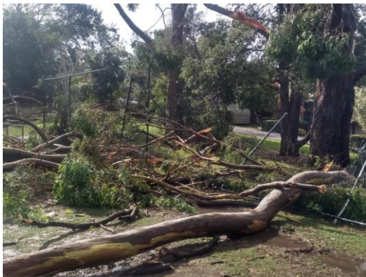
Photo : Campbell Park immediately after the Storm passed – Saturday 15 December 2018.