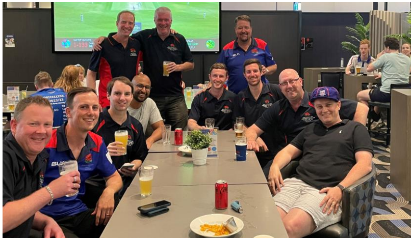
Photo: Our 1 st Rofe Shield Premiers @ Mark Taylor Oval, 25 March 2012