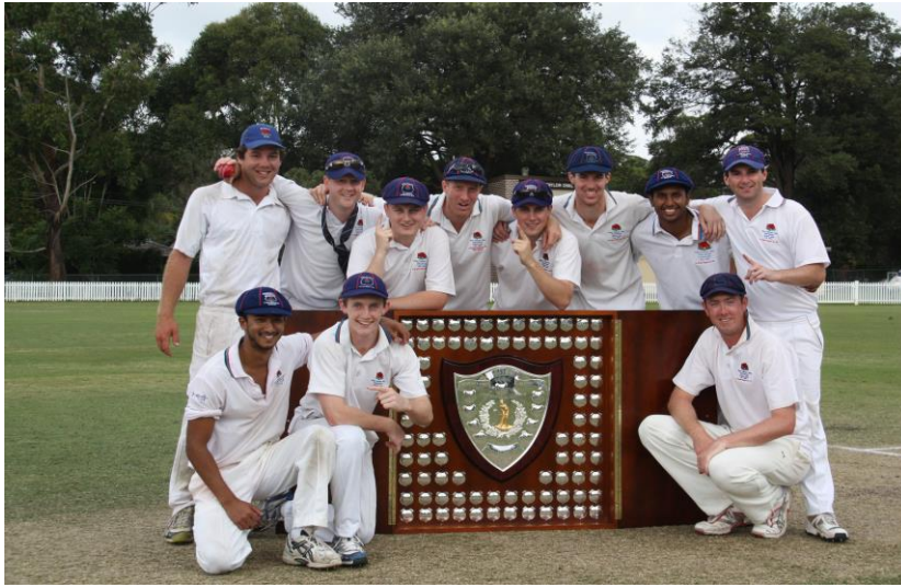
Photo – the first of our winning dynasty.