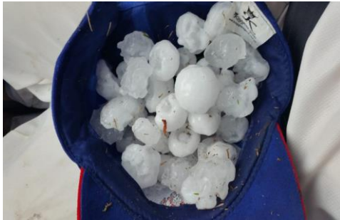
Photo – Fred Caterson 6 during our U13 Girls game against Lindfield – 18 February 2017

Just to complete the picture, on Saturday 18 th February 2017 (one week after all games were abandoned due to heat), all Seniors games were abandoned due to an intense hail storm.