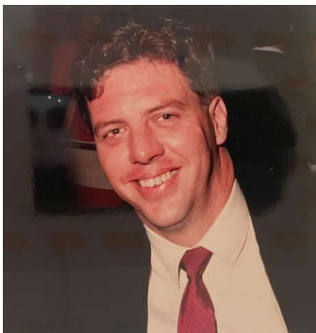
1 st June 1991