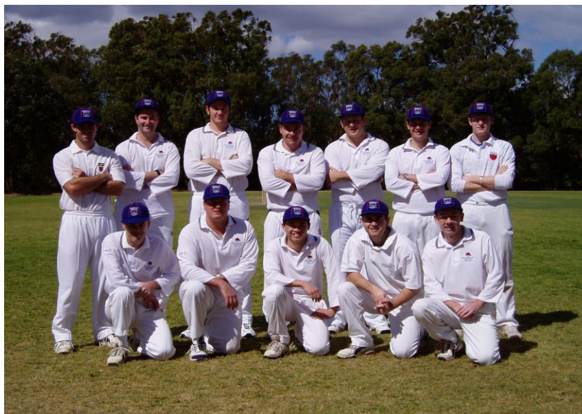
WPHCCC A-Grade Winners 2002-2003