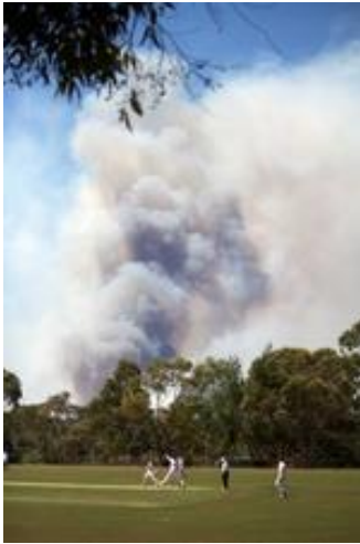
Photo – A1 fast bowler, Scott Henderson bowling to Hornsby @ Parklands Oval 20 th October 2012 with a bush fire burning in the background.