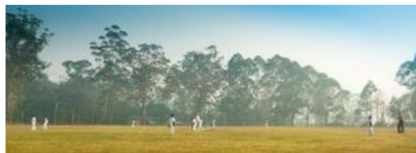
Photo – a smokey Day at Galston Park with the U9 Gold’s playing Redfield College. This was when the bushfires in the Blue Mountains were still burning in the 2013 fires. It could almost pass as one of those famous Australian outback paintings but this is the real thing – Galston Park 2 November 2013.