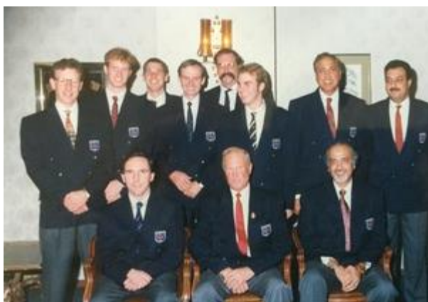
Photo – the great B Grade side of the late 1980s and 1990s that competed in every B1 / B2 Finals series between 1986/87 and 1998/99.