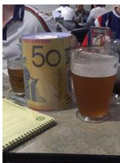
Photo: The A2 Fines tin (2015/16) that raised $2,150 for the boys end of season (EOS) party – 24 th October 2016 at the WPH Sports Club.

One of the traditions of many Teams is to fine players through the season indiscretions that are often created to raise funds for the end of season party / trip away. In the 2015/16 season our A2 boys set new standards. After good success in 2014/15 they raised $1,700 and went on to win the A2 Premiership. In 2015/16 they finished with $2,150 and this time finished 2 nd .