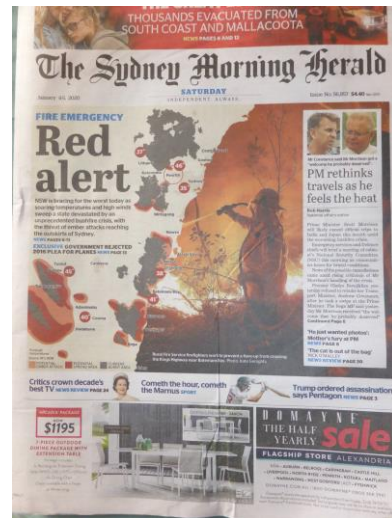
Photo : A map of the worst bushfire bushfires in NSW that occurred during the summer of 2019/20 (November / January). This map is a snapshot of the fire coverage on 2 January 2019.