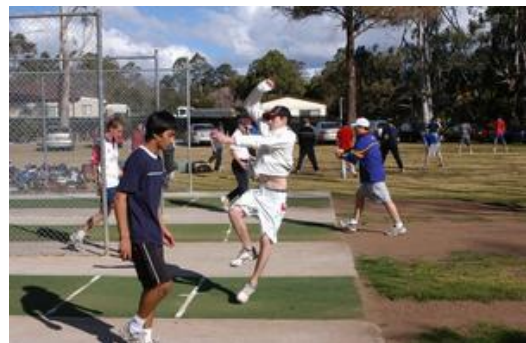
Photo – the nets being used at pre-season training in 2004/05. The site of these nets is now the tennis courts that front New Line Road.

The replacement nets were first used for Club training on Saturday 7 th September 2013.