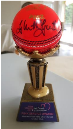
Photo: McGrath Foundation Pink Service Award in March 2021