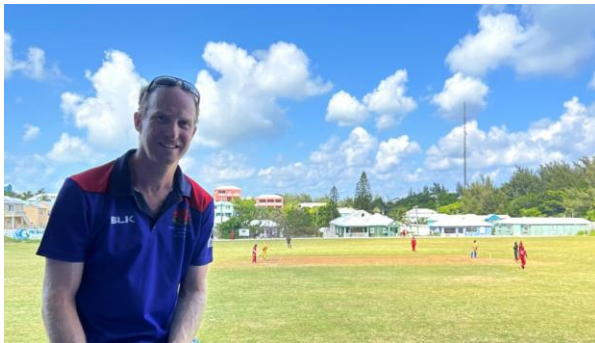
@ Bermuda – 15 July 2023