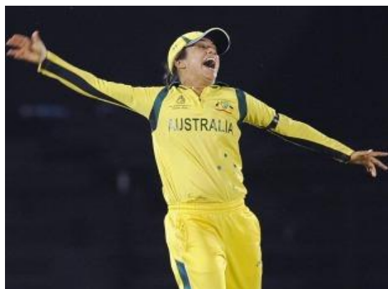
Photo – Lisa Sthalekar celebrating after taking the winning catch in the ICC Women's World Cup Vs West Indies. Lisa retired on 17 February 2013 (immediately after the game where this catch was taken) having played her first International game on 15 February 2003.