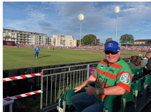
Photo: Andrew Fiedler @ the 2019 World Cup (Australia Vs Afghanistan) Bristol 1 June 2019