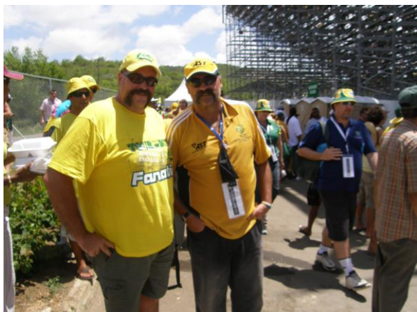
Photo: Dale 'Merv' Armstrong (left) with Merv Hughes at the World Cup 2007.