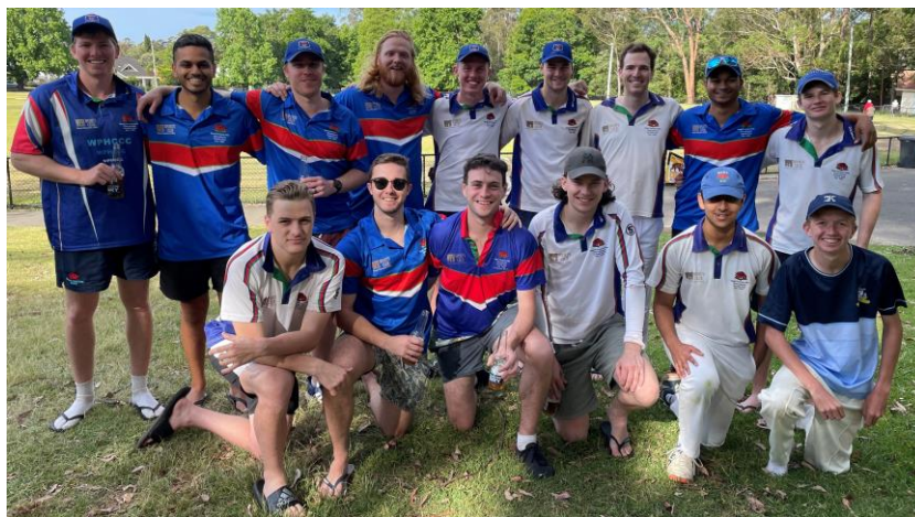
The A1 (Red & Blue Teams who played in a combined A1 Comp in 2022-23)