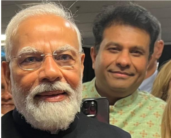
Photo: Sreeni with Prime Minister Narendra Modi @ Qudos Stadium 23 May 2023.