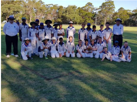
Photo – The U11 Purple and Red Teams in the 2017/18 Grand Final played at Thornleigh Oval – 11 March 2018.