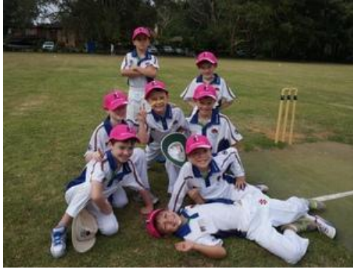
Photo – our U9 Blue’s ready to do "battle" with our U9 Orange at Cherrybrook Public School – McGrath Pink Stumps Day 22nd February 2014.