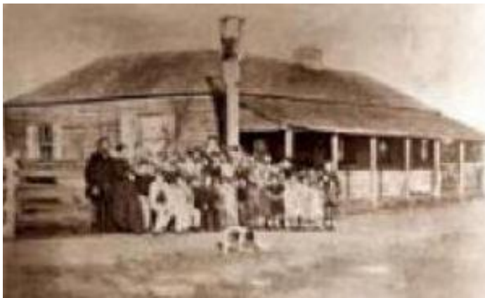
Photo: Pennant Hills West Public School circa 1870.