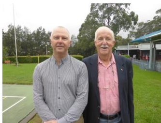
Oakhill Drive Public School, 18 March 2017