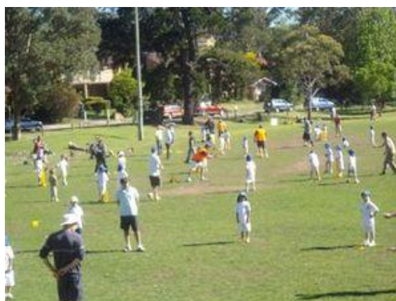
Photo – Kanga kick-off – Saturday 17th October 2009 at Edward Bennett Oval. 120 Kanga's plus dads, mums and grandparents.