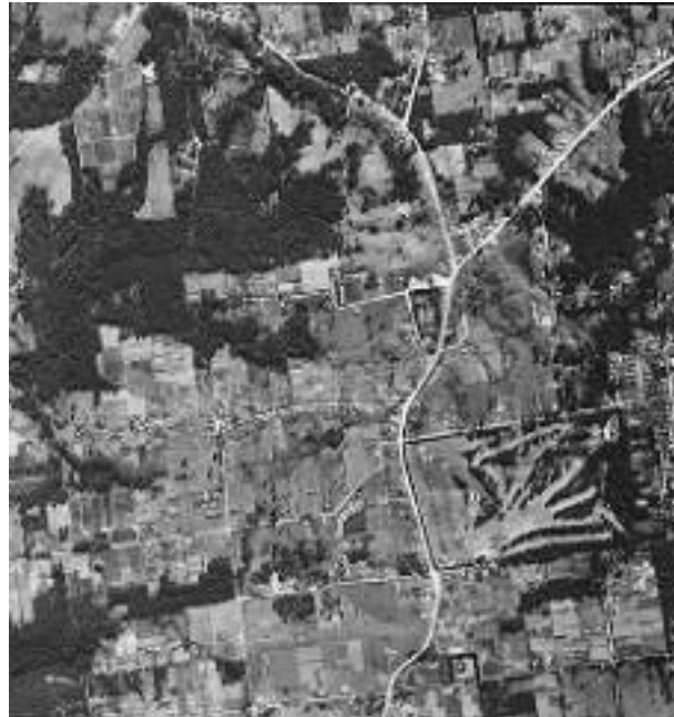
Photo: Aerial photo of West Pennant Hills in 1951. Pennant Hills Golf Course is shown on the bottom right. The fork in the road is Thomson’s Corner. At the top of the photo, the orchards along New Line Road can be seen.

In February 1959 the first Project home village in Sydney was built on land sub-divided on this location. Larger scale land releases and development started in West Pennant Hills in 1968 and accelerated to include Cherrybrook throughout the 1970s and early 1980s.