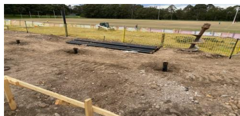
Construction starts – 13 September 2020