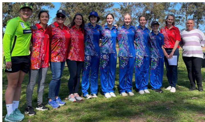
Photo: Launch of the Girls Players (Blue) and Volunreers (Red) outfits – WPH Public School 18 September 2022

On Wednesday 25 May 2022 our Club Executive Committee approved a radical design change in the playing uniform exclusively for our Women (Volunteers) & Girls (Players).