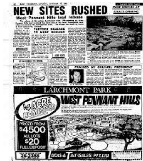
Photo: Sydney Daily Telegraph from Saturday, 14 September 1968 (page 32) referring to “...one of the most remarkable land releases ever seen in the metropolitan area”.

In February 1959 the first Project home village in Sydney was built on land sub-divided on this location. Larger scale land releases and development started in West Pennant Hills in 1968 and accelerated to include Cherrybrook throughout the 1970s and early 1980s.