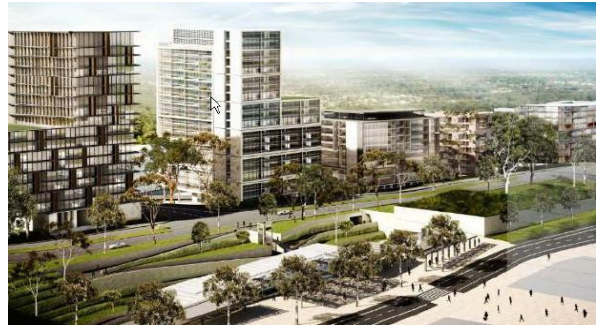
Photo – proposed Cherrybrook Station opposite the new train station

Source: Daily Telegraph Tuesday 28 February 2017