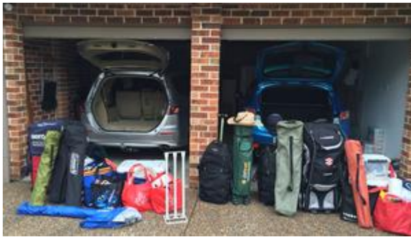
Photo – it must be the first week of January. Here the Bish family are ready to pack the car before heading off to Taree and Armidale – 3 January 2016.

One of the privileges of playing for West Penno is the chance to play in the Country Carnivals over the New Year. Traditionally this opportunity is reserved for Representative Teams but we are privileged to be invited due to our Club size – the only Club side in NSW to have this opportunity.