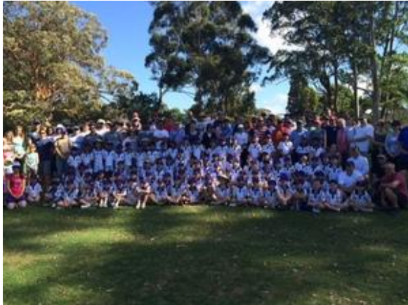
Photo: Kangas spending a moment in memory – 29 th November 2014 at Edward Bennett Oval.

The 27 November 2014 saw the loss of Phillip Hughes through a tragic accident at the SCG. Across Australia recognition was given to Phillip through many gestures. The following photos capture the moment in our Club.