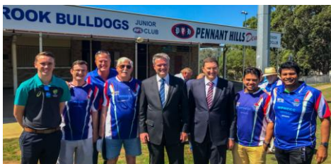
With Mathias Cormann 15 March 2018

From the 2021/22 season, we started using the Community Centre for major Events such as Presentation Nights. A photographic history of the initiative follows: