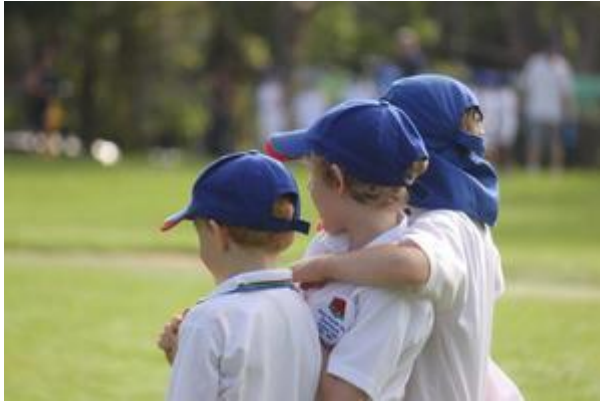
Photo – Kanga 2012/13 at Edward Bennett Oval.