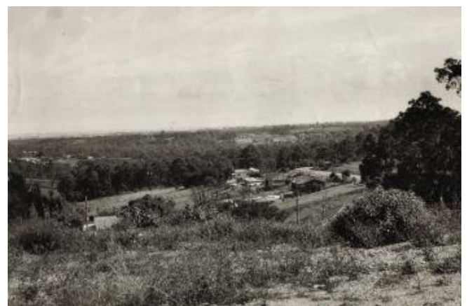
Photo: Oratava Avenue and the West Pennant Hills Valley from Pennant Hills Rd, 1962.

Note the cost of $4,500 for ¼ acre blocks with $20 for a full deposit!