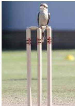
Photo: a Kookaburra enjoying the game at Asquith Oval – March 2011.