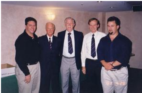
Photo – Life Members at the Seniors Presentation Night, Hornsby RSL 1998.