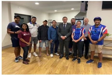
Official Opening 30 March 2021