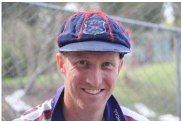
A1 Semi Final Vs St Ives @ Parklands Oval 11 March 2017.